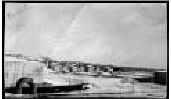
Three similar styles of homes were built in Redel, still located at 163rd and Mission Rd.

The Redel neighborhood remains as an important reminder of the thriving early-twentieth century industrial community. It is representative of not only railroad history but industrial technology. At its construction, the pumping station was a state-of-the-art facility for the transportation and distribution of petroleum products. It is now a quiet residential community in a rapidly expanding part of the county.