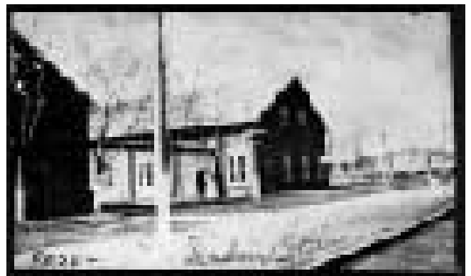
The Prairie Oil & Gas Company's, a subsidiary of The Standard Oil Company, pumping station was a state-of-the-art facility for transporting and distributing petroleum products.

Three similar styles of homes were built in Redel. The homes were originally built of wood frame with weatherboard siding, brick foundations and chimneys. The original weatherboard was recovered with asbestos siding in the early 1960s. The smoke produced by the nearby pumping station contained so much oil residue that it saturated the wood clapboards of the nearby homes. Eventually, the oil buildup in the wood siding kept the paint from adhering to the wood. As a result, the homes were recovered in Asbestos shingles to resist the oil saturated smoke. The house located at 16310 Mission Road has been restored its original